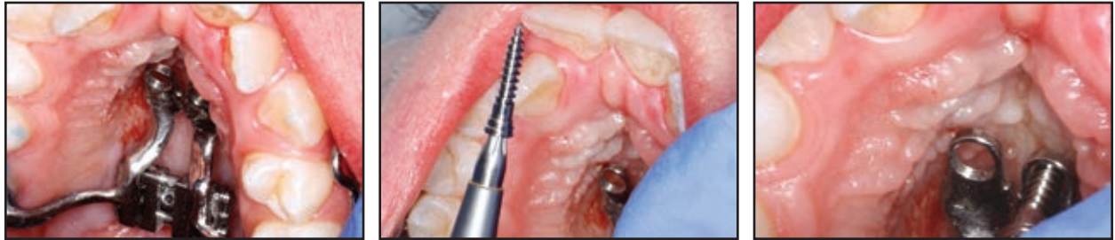
Fig. 4 Installation of Hybrid Hyrax and mini-implants following Benefit Direct protocol.