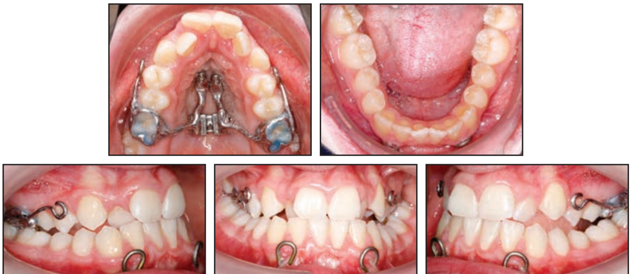
Fig. 5 Beginning of maxillary expansion and protraction.

canine relationships. The panoramic radiograph revealed a lack of space for the upper anterior teeth. Cephalometric analysis (Table 1) showed a mild skeletal Class III (Wits appraisal = -1.7\text{mm} , ANB = -2.3^\circ ) with a retrognathic maxilla (SNA = 75.3^\circ ) and slightly retrognathic mandible (SNB = 77.6^\circ ).