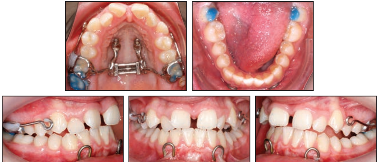
Fig. 6 After nine weeks of alternate rapid maxillary expansion and constriction (Alt-RAMEC) protocol and protraction with Class III elastics.

Hyrax expander was bonded ‡ in the orthodontic clinic, also under local anesthesia (Fig. 4). Two 2mm × 9mm mini-implants were inserted through the rings until a tight connection was achieved.