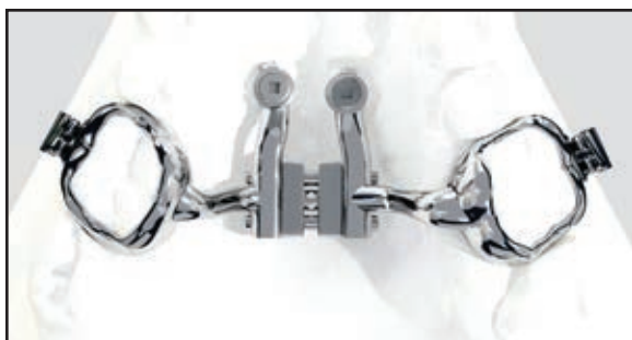
Fig. 1 Hybrid Hyrax* for rapid maxillary expansion with anchorage from two mini-implants and two molar bands.