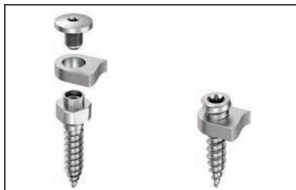
Fig. 2 Benefit Direct** mini-implant attaches to Hybrid Hyrax frame using specially designed ring and small fixation screw, providing tight connection with as much as 15° tolerance in insertion angle. Long intraosseous thread engages in palatal bone.

To ensure stability and reliability of the mini-implants, they should be placed in areas with the best quality of cortical bone. Several cone-beam computed tomography (CBCT) studies have found the best bone to be located in the anterior palate, in an area called the T-Zone. 33-35 With the original Hybrid Hyrax, the mini-implants were placed paramedian to the anterior palate in the T-Zone, and